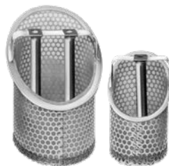
Baskets shown with optional magnetic inserts to trap fine ferrous particles