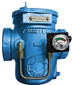
Strainer shown with optional pressure differential indicator