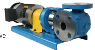
(H4123A D Drive)