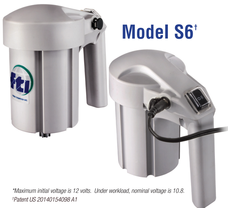
Model S6 +